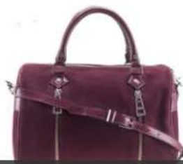
Ladies Purple Purse