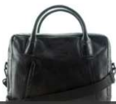
Black Leather Bag