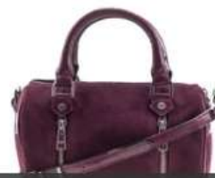
Red Cherry Ladies Bag