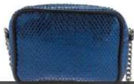
Blue Leather Hand Bag